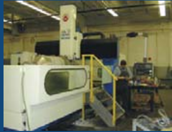
CNC VERTICAL MACHINING CENTER