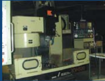
VERTICAL CNC MACHINING CENTER