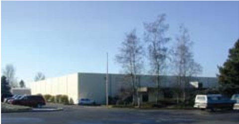
Mount Angel Plant

1010 N. Main Street - Mt. Angel, OR 97362 Phone: 503-845-9411 - Fax: 503-845-6012